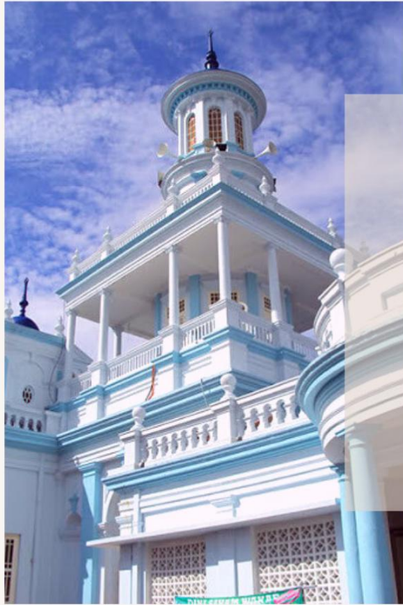
M A S J I D J A M E K S U L T A N I B R A H I M , M U A R , M A L A Y S I A